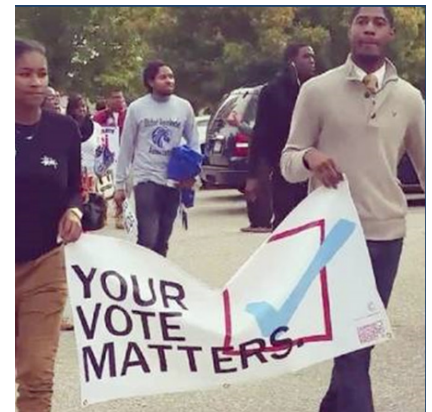
Fayetteville State (NC) Parade to Polls with CEEP banner

Do these efforts increase the student vote? Short answer: Definitely. In 2014, student precinct turnout at campuses we could measure increased by 16% from 2010, when we weren't running the project, despite the national 18-24-year-old vote dropping 17%. Because we were working with many of the same schools in 2012, we couldn't do a clean 2012 vs. 2016 comparison. But schools say we helped them engage their students even more deeply and intensively, and we're seeing impressive increases, like 7,200 more Ohio State students voting in 2016 than in 2012.