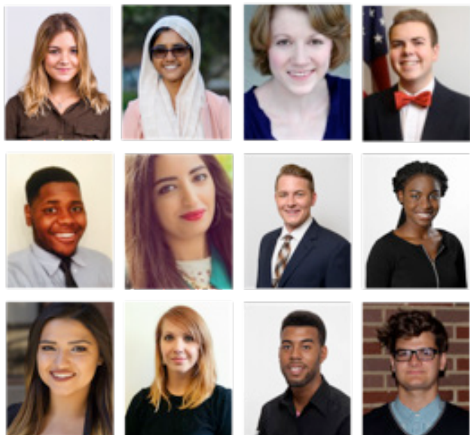
SOME OF OUR CEEP FELLOWS

CEEP also supports Election Engagement Fellows, students who get $1,000 stipends to work with college staff and student leaders to carry out our approaches and recruit and lead volunteer teams of their peers. In 2013 our first Virginia Tech Fellow led a team that registered 3,000 fellow-students in an election where the Attorney General race was decided by 165 votes. These students greatly magnify our impact while gaining critical skills and experience. They've called their involvement "life-changing," and "the most important thing I've ever done," saying their conversations across political lines gave them "insight into what it really takes to keep a democracy on a healthy path." They're a key part of our 2018 plans. You can get a sense of their stories here or view an interview with a Fellow from the University of Nevada Reno .