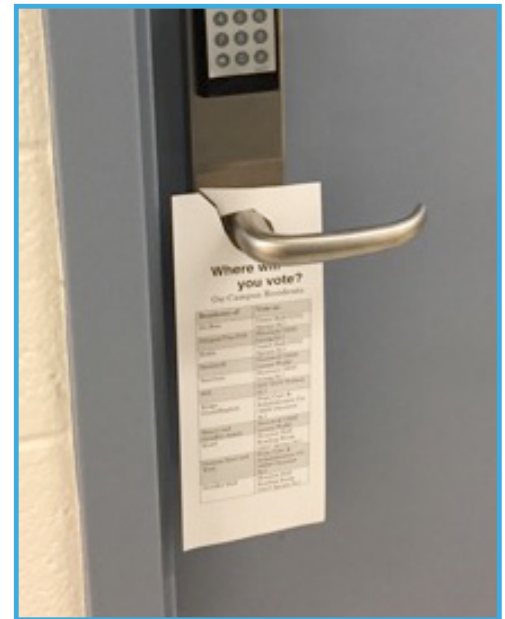
DORM STORMS "GET OUT THE VOTE" DOOR HANGER.